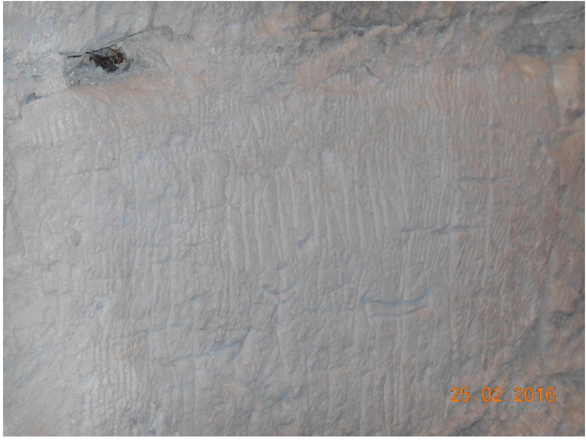
Figure 9 – inscription B – h e r e b e r e k t – Harbrecht