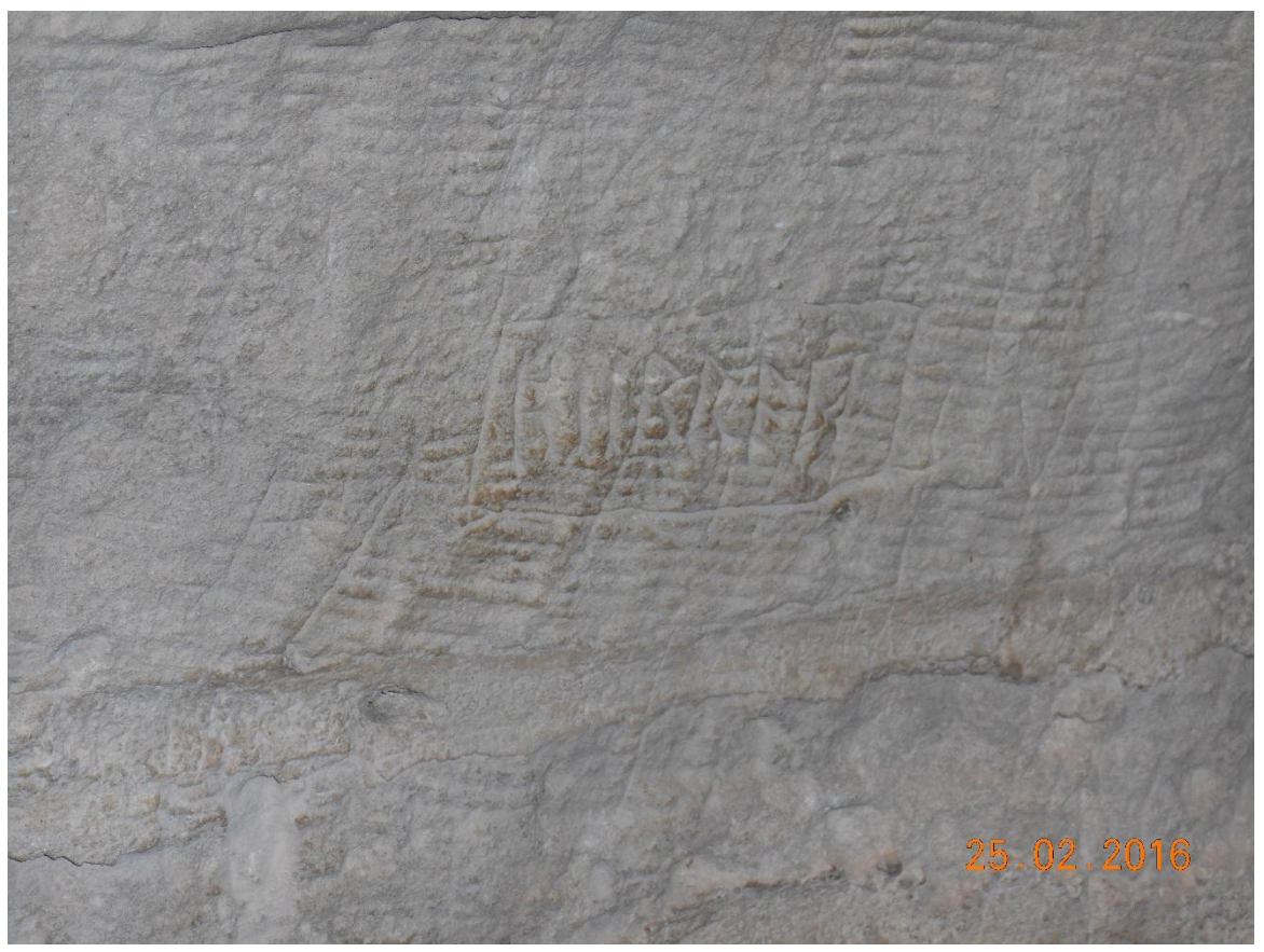
Figure 12 – inscription A – h e r r ae d – Harrod