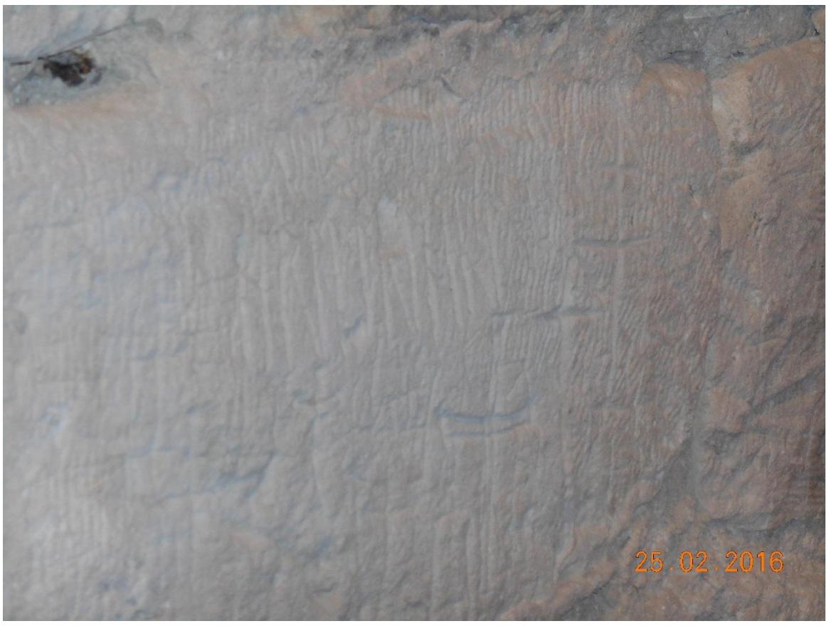
Figure 10 - inscription B - h e r e b e r e k t - Harbrecht