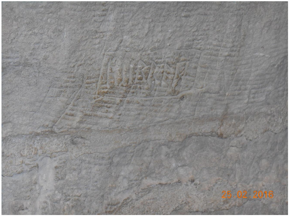
Figure 13 – inscription A – h e r r ae d – Harrod