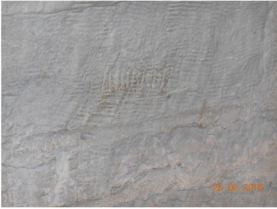
Figure 11 – inscription A – h e r r ae d – Harrod