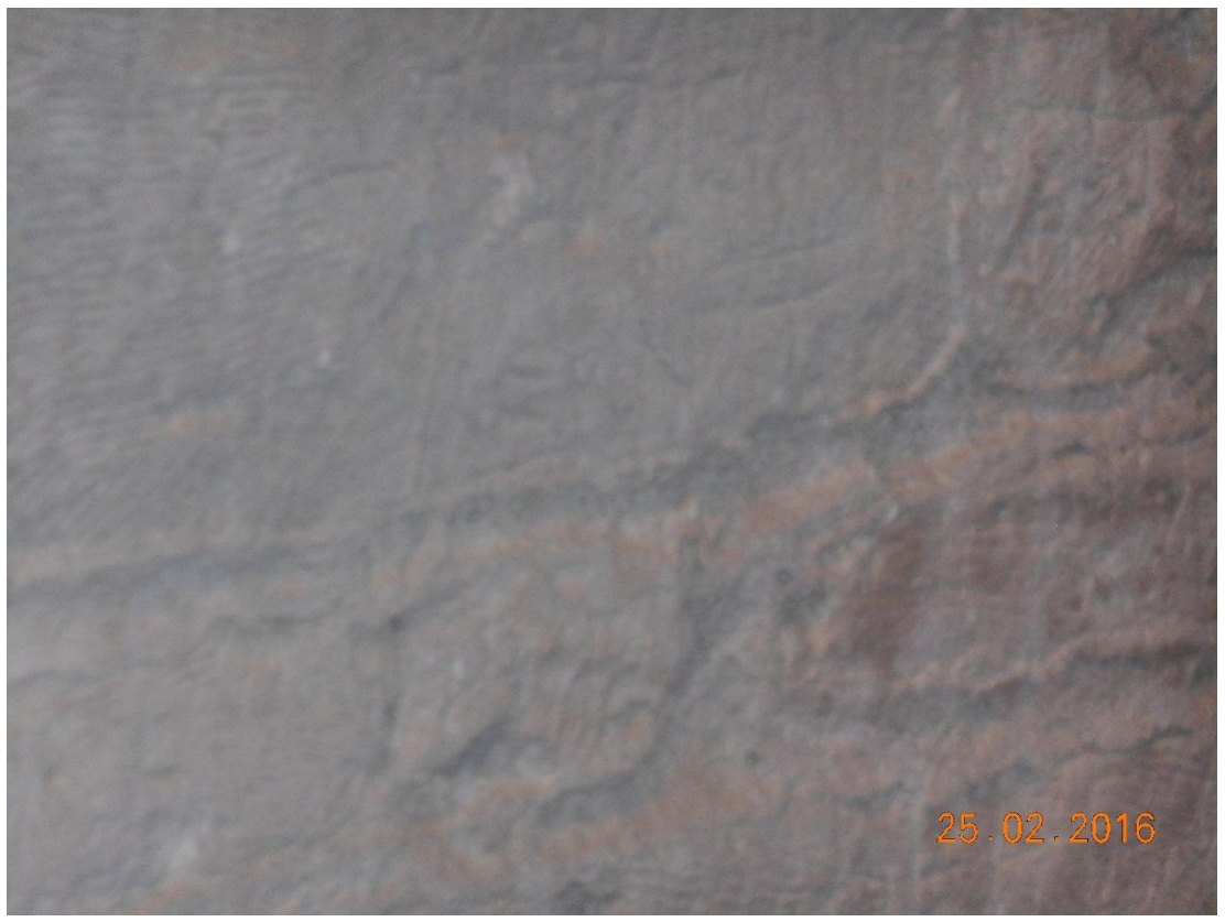
Figure 3 – inscription D – a ae r m - Erman