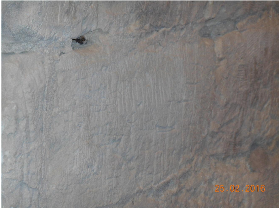
Figure 7 – inscription B - h e r e b e r e k t - Harbrecht