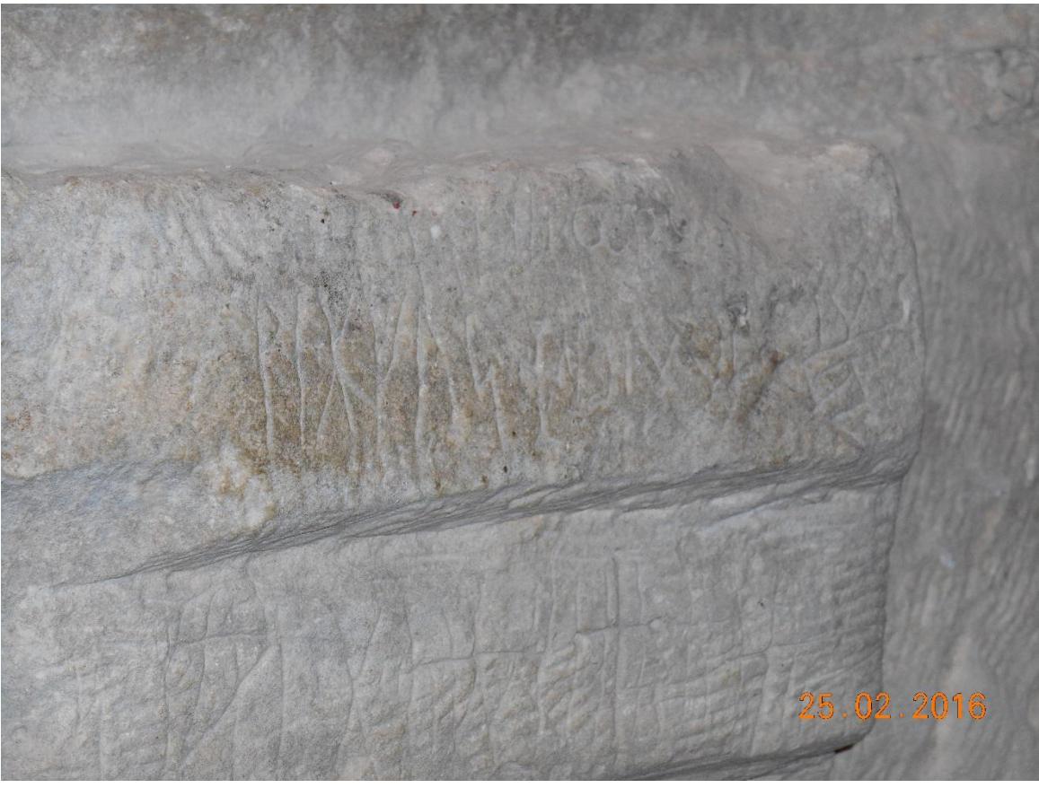
Figure 14 – inscription C – w i g f u s – Vikfus