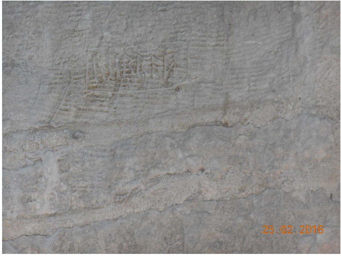
Figure 1 – inscription A – h e r r ae d – Harrod