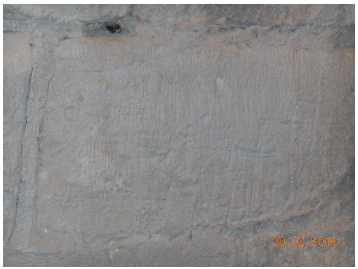
Figure 8 – inscription B – h e r e b e r e k t – Harbrecht