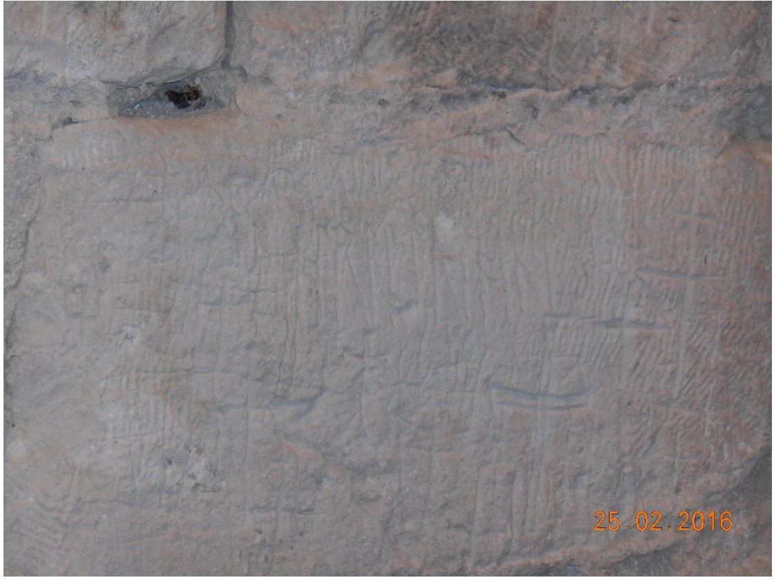
Figure 5 – inscription B – h e r e b e r e k t – Harbrecht