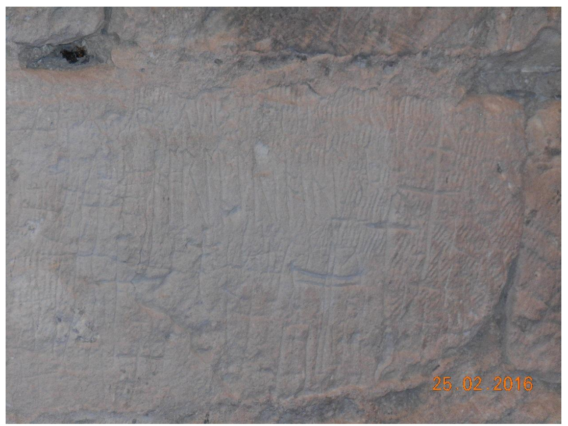
Figure 4 - inscription B - h e r e b e r e k t - Harbrecht