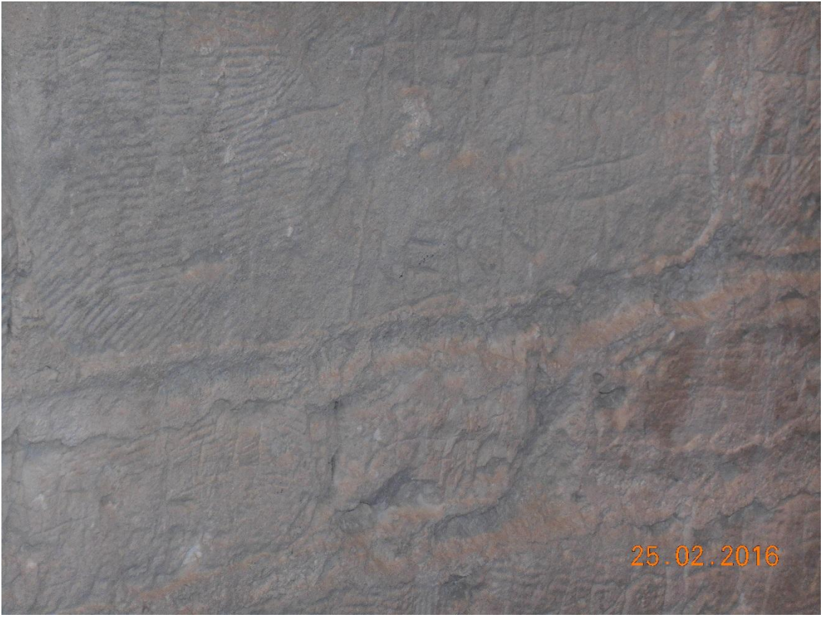
Figure 15 – inscription D – a ae r m - Erman