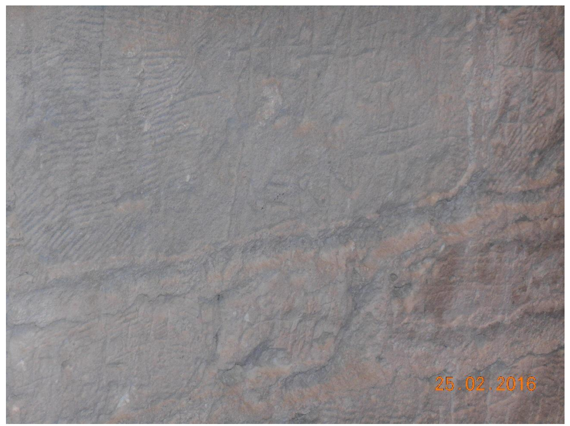
Figure 2 – inscription D – a ae r m - Erman