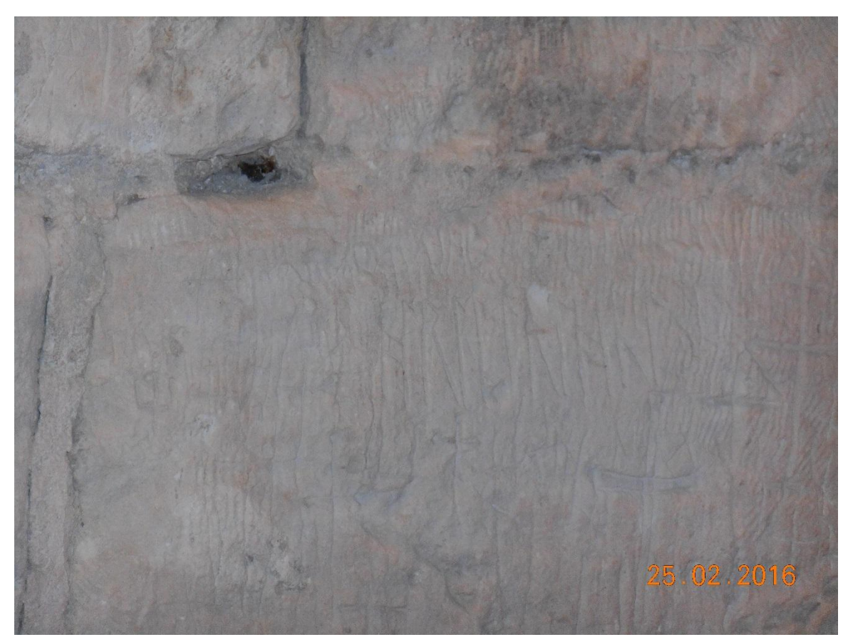
Figure 6 – inscription B – h e r e b e r e k t – Harbrecht